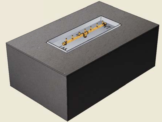
FR4830 - 48" x 30" Rectangular Fire Pit Kit shown with a 84K Linear Burner. Other burner options available.